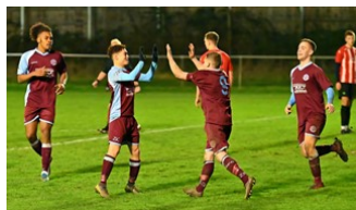
Rovers celebrate scoring in their final home game of 2019/20 against Shortwood United

That was to prove the last of the action for Rovers. By the time the weather had improved and Flackwell Heath were set to host our visit, a pandemic came along and swiftly ended the season.